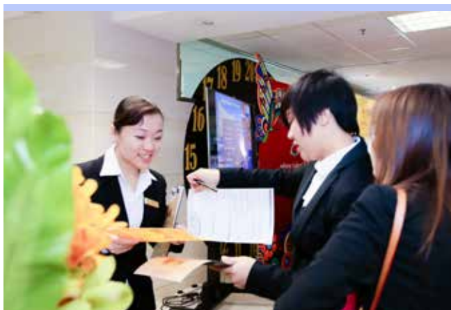
舉辦“就業發展日” Organised “Career Day 2012”