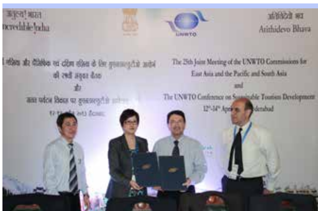
與聯合國世界旅遊組織簽訂合作協議 Signed protocol with United Nations World Tourism Organization (UNWTO)