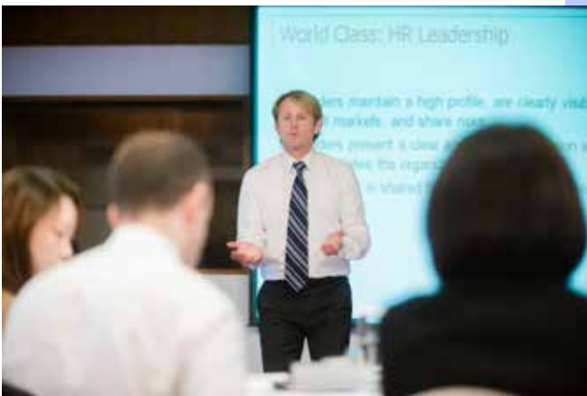
與美國康奈爾大學酒店管理學院合辦 “如何構建人力資本：部門經理必備 的人力資源技能”高級管理課程 Co-organised Executive Development Programme on “Building the Human Capital Base: Essential Human Resources Practices for Managers” with Cornell University School of Hotel Administration, USA