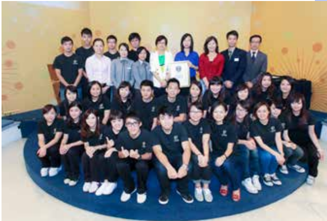
旅遊會展及節目管理三年級學生舉辦大型主題系列活動“一世代一腳印”；以超過二萬張具有澳門特色的明信片拼砌出總面積299平方米的巨型畫布刷新健力士世界紀錄 Tourism Event Management Year 3 students organised “Z Generation, One Destination” event series and earned the Guinness World Records™ as the largest postcard mosaic in the world by creating a giant postcard mosaic (299sqm) featuring Macao landmarks with over 20,000 postcards