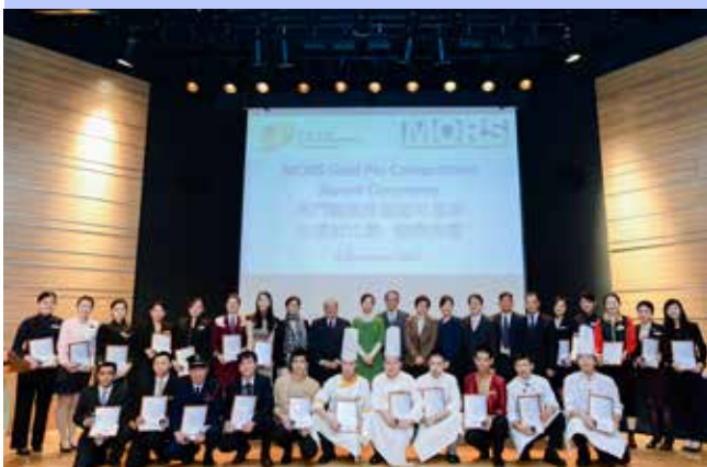
澳門職業技能認可基準金襟針比賽 及頒獎典禮 MORS Gold Pin Competition and Award Presentation