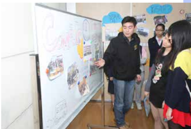
開放日 Open Day