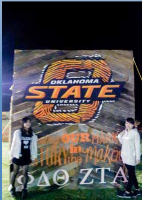
美國俄克拉荷馬州立大學 Oklahoma State University, United States