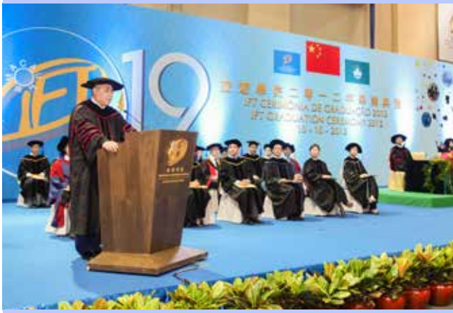
旅遊學院2012畢業典禮 Graduation Ceremony 2012