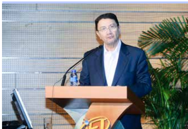
聯合國世界旅遊組織秘書長塔勒布· 瑞法依博士於學院主講“旅遊業： 十億遊客，十億機遇”公開講座 Dr. Taleb Rifai, the Secretary-General of United Nations World Tourism Organization (UNWTO) delivered a public lecture on “Tourism – One Billion Tourists, One Billion Opportunities” at IFT