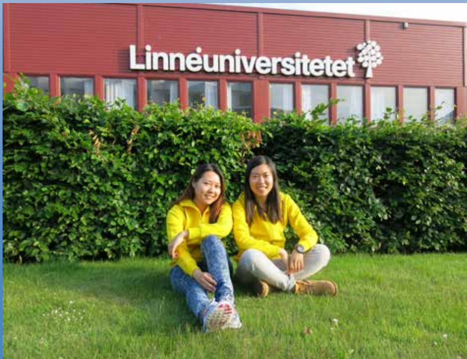
瑞典林奈大學 Linnaeus University, Sweden