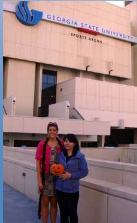
美國佐治亞州立大學 Georgia State University, United States