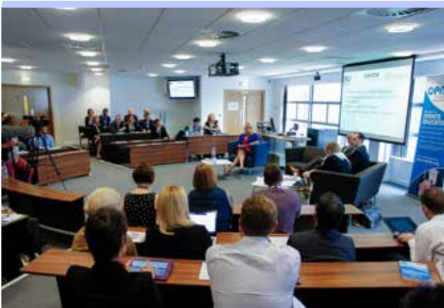
與英國波恩茅斯大學於英國合辦“2013年會展及節目國際學術會議” Co-organised the International Conference on Events (ICE 2013) held at Bournemouth University, UK