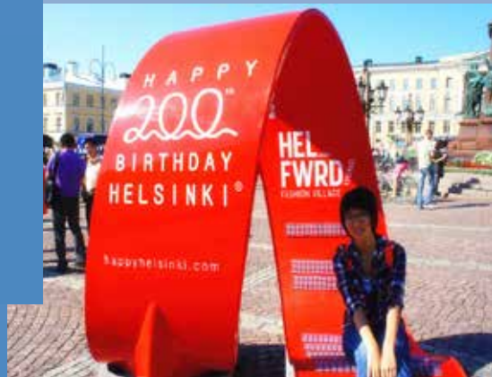
芬蘭 Haaga-Helia 科技應用大學 Haaga-Helia University of Applied Sciences, Finland