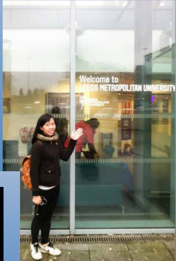
英國利茲都會大學 Leeds Metropolitan University, United Kingdom