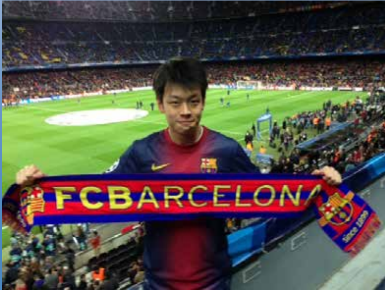
瑞典林奈大學 Linnaeus University, Sweden