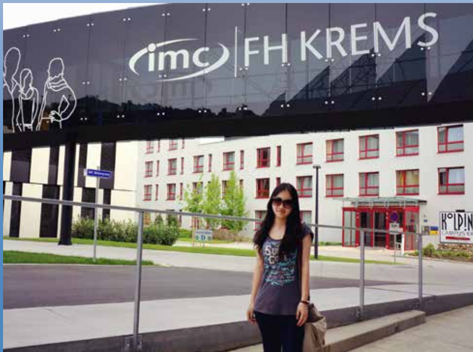
奧地利 IMC 科技應用大學 IMC University of Applied Sciences, Austria