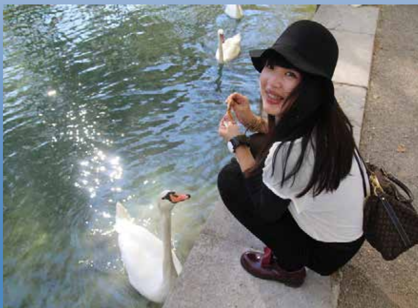
瑞士格里昂酒店管理大學 Glion Institute of Higher Education, Switzerland