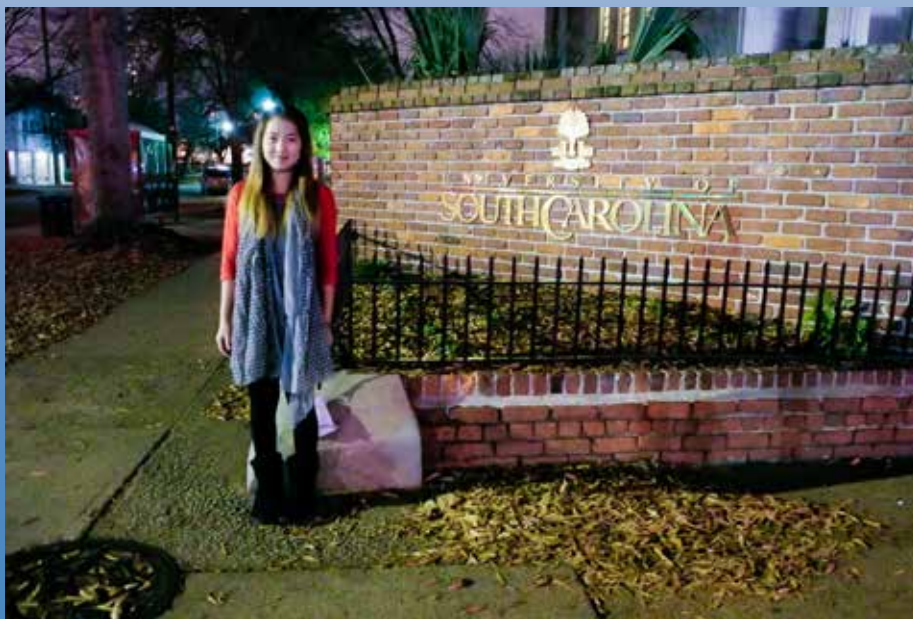
美國南卡羅萊納大學 University of South Carolina, United States