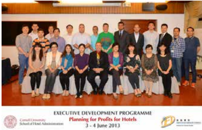
與美國康奈爾大學酒店管理學院合辦“酒店盈利規劃”高級管理課程 Co-organised Executive Development Programme on “Planning for Profits for Hotels” with Cornell University School of Hotel Administration, USA