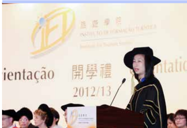
旅遊學院2012開學禮 Student Orientation 2012