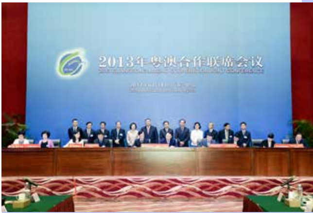
與南沙區教育局簽署《職業教育合作框架協議書》 Signed the Agreement Framework on Occupational Training Cooperation with Education Bureau of Nansha District, Guangzhou, PRC