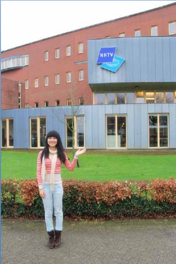
荷蘭布列達科技應用大學 NHTV Breda University of Applied Sciences, the Netherlands