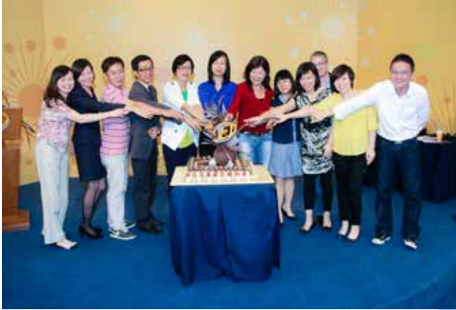
旅遊學院17週年校慶 Celebrated the 17 th Anniversary of IFT